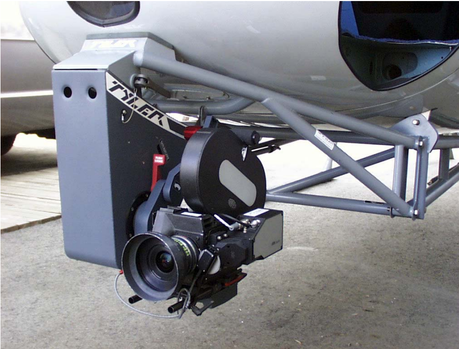
Figure 1. Nose Mount

The Tyler Nose Mount Systems consists of the 4130 steel tubular frame members mounted to the underside of the airframe and a nose mount. The undercarriage structure, aft of the chin bubble, is common to most all the mounts.