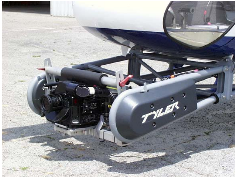
Figure 2. Super Nose Mount

The "Multi-Cam Mount" (figure 3) can accommodate up to 6 cameras and also requires the counter weight.