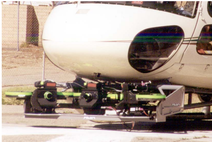
Figure 3. Multi-Cam Nose Mount

The "Multi-Cam Mount" (figure 3) can accommodate up to 6 cameras and also requires the counter weight.