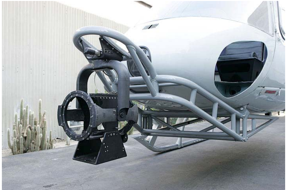
Figure 5. NSWC Nose Mount

The information to compute the weight and balance, and maximum allowable electrical load can be found in the Tyler Installation Manual TMX 3-98 for the particular sensor to be installed. It is the pilot and installers' responsibility to comply with the installation instructions, procedures, and limits listed the Installation Manual.