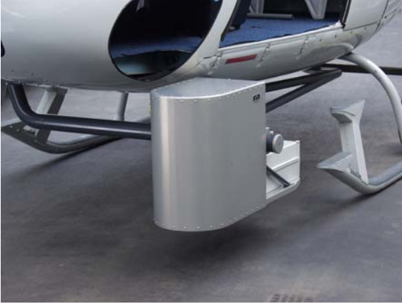
Figure 4. National Grid Nose Mount

The “National Grid Nose Mount” (figure 5) positions the camera/sensor on the left side outboard of the fuselage. No counter weight required.